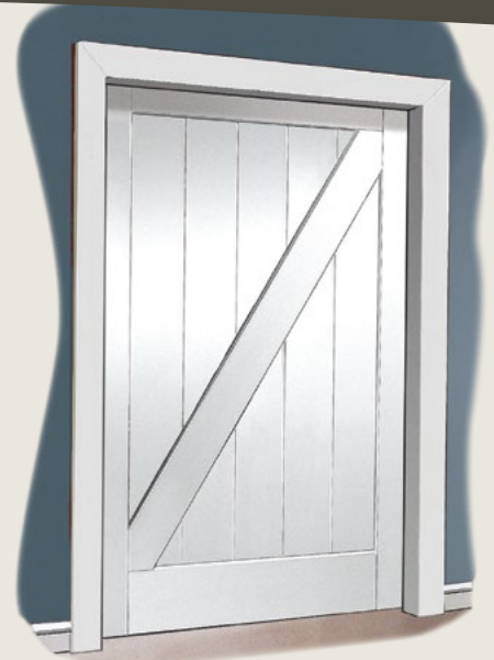
STILEChoice® Barn Door Specification as viewed from the opposite side.

than your finished opening. Using the Barn Door Specification, the door — when viewed from the opposite side, in the closed position — the stiles and rails will look normal and proportional, rather than too narrow.